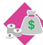
Long-term wealth growth

Desmond is diagnosed with heart disease at age 55 (ANB). EmpowTech receives the Critical Illness Benefit and uses the benefit amount to support Desmond as a staff benefit and pay for the medical expenses incurred.